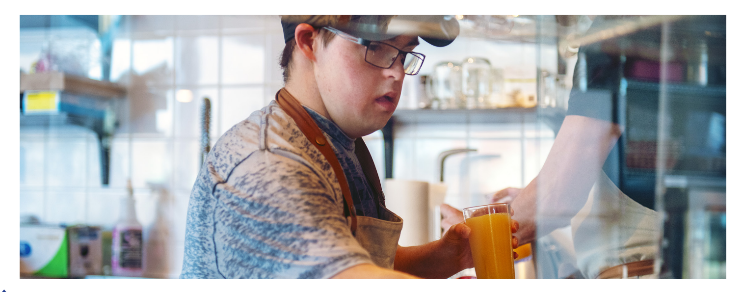
2019 WorksWonders: Texas Purchasing from People with Disabilities